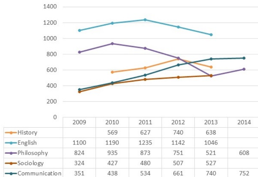
Figure 2. Number of Job Postings in History, English, Philosophy, Sociology, and Communication, 2009-2014. Sources: American Historical Association, Modern Language Association, American Philosophical Association, and American Sociological Association

Figure 2 compares Communication academic job postings with other similar disciplines. Not all of the other disciplines have released their job postings data for 2014. The data reported are as currently available from the other learned societies.